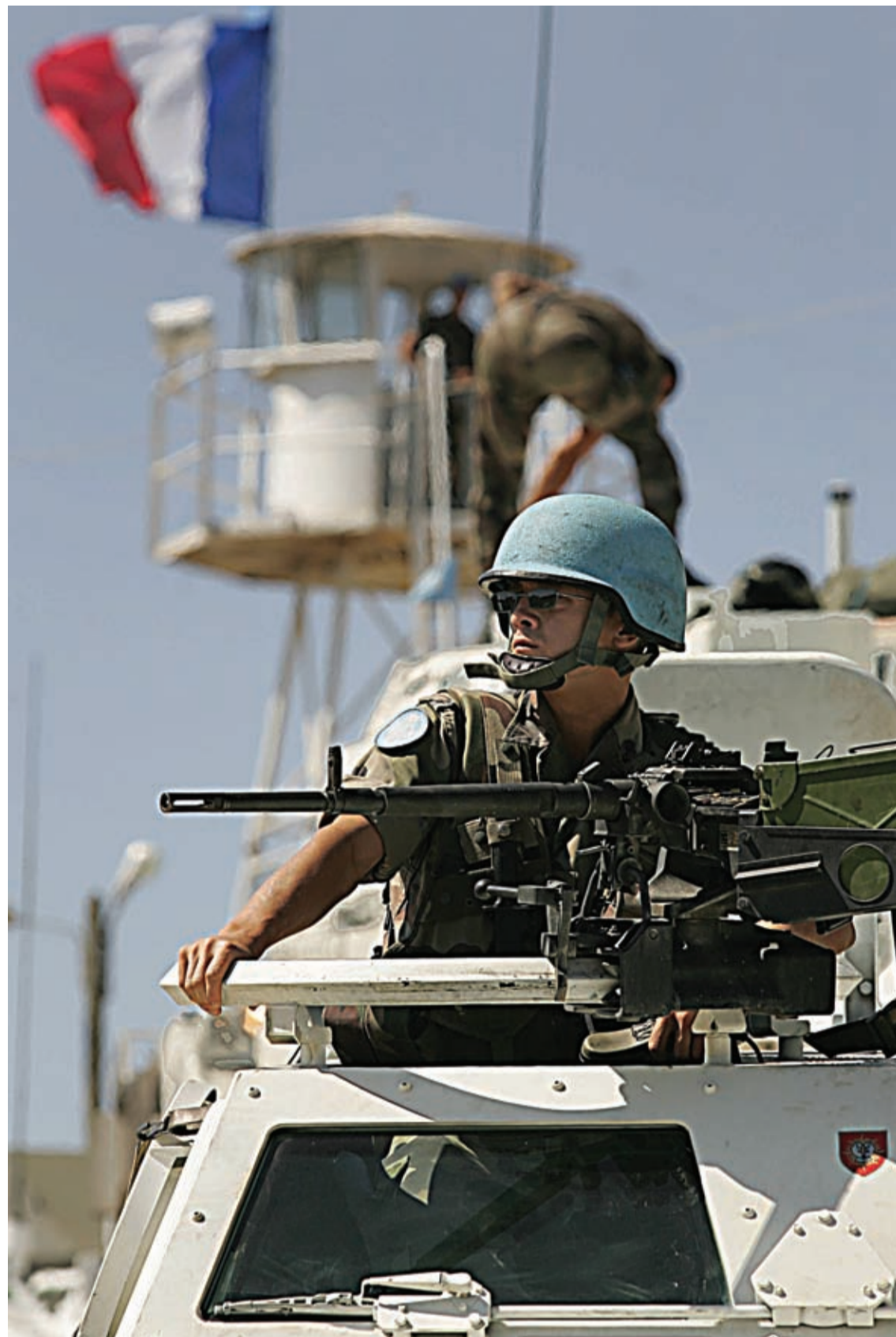
A French patrol, part of a multinational peacekeeping force, outside the southern Lebanese village of Al-Tiri in 2006.

France was thus actively present, long before the mandate instituted by the League of Nations in April 1920. The proclamation of Greater Lebanon was the crowning achievement of a relationship