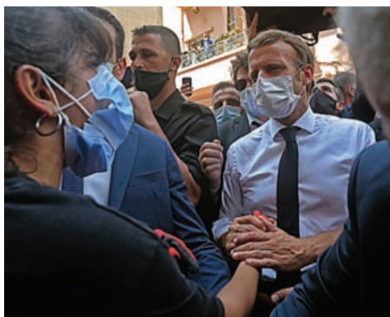
French President Emmanuel Macron tours a shell-shocked Beirut in the wake of the devastating port blast in the capital.

The symbolism could not have been stronger. On Sept. 1, 1920, French Gen. Henri Gouraud, representing the French mandate authority, proclaimed the State of Greater Lebanon from the Pine Residence in Beirut. On that day, Lebanon set out on its path toward independence, which it gained — for better or worse — 23 years later, on Nov. 22, 1943.