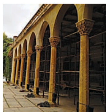
Sursock Palace, a typical example of mandate-period design.

The stones were covered with limestone or cement to protect