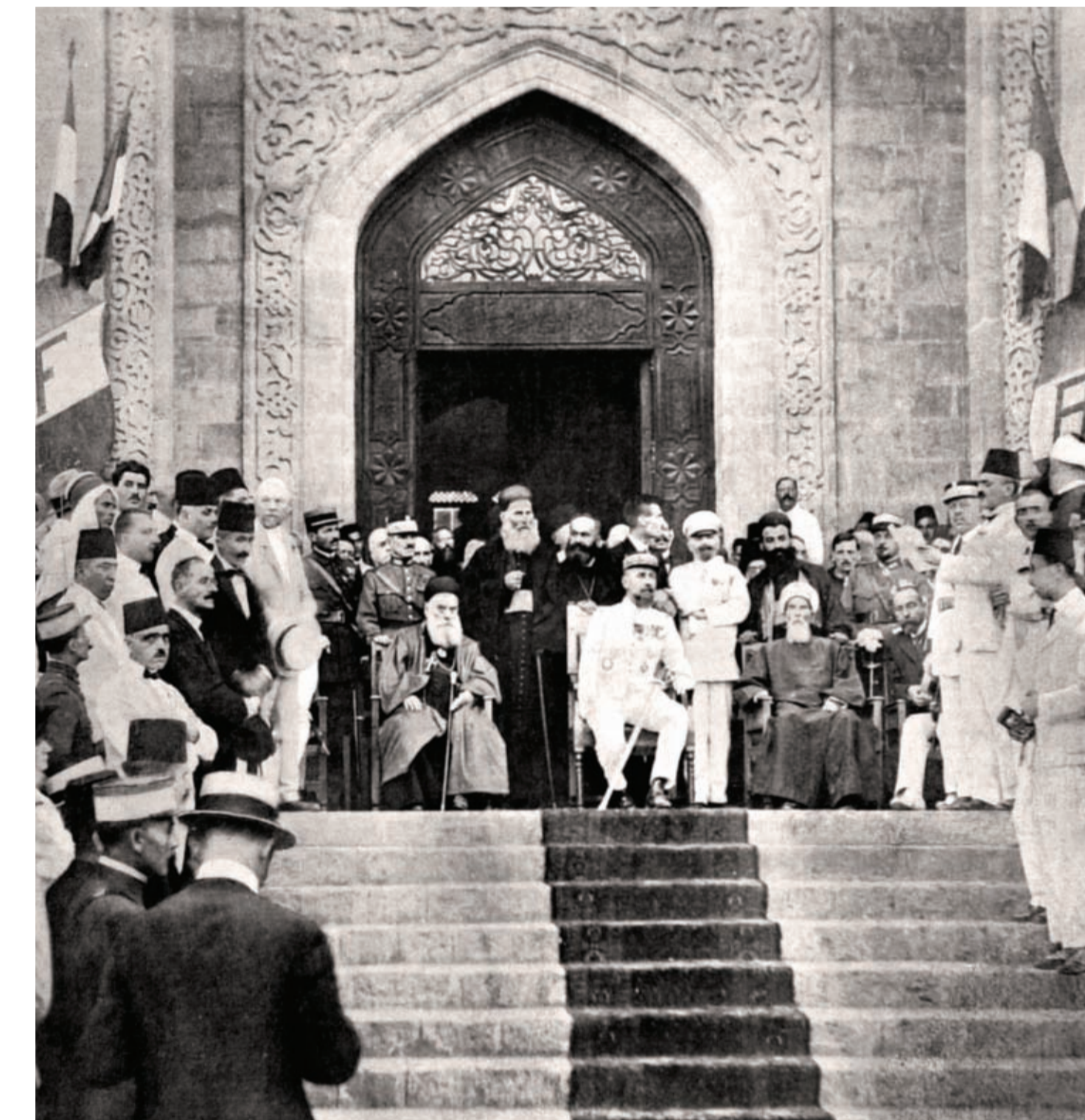
The proclamation of Greater Lebanon: Gen. Henri Gouraud (center) flanked by Maronite patriarch, Msgr Hoyek, and Gov. Negib bey Abussuan.

Paris and London were negotiating their own new order for the Middle East, and it could not have been more anathema to Wilson's