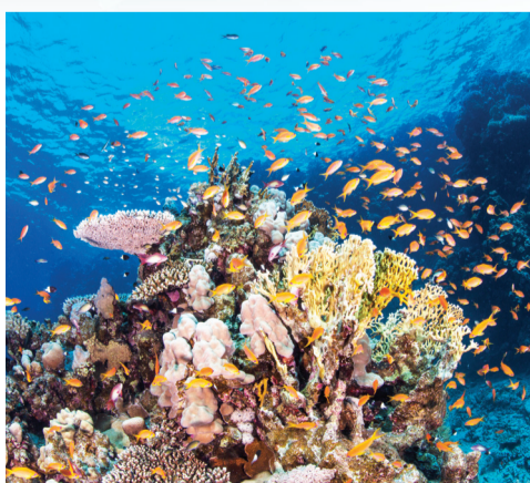
NEOM is aiming to become a world leader in sustainability, creating a thriving ecosystem for all.

On top of this, NEOM is aiming to be a global center for technology and innovation, with