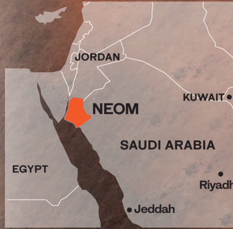
The Line is located in NEOM, linking the coast of the Red Sea with the mountains and upper valleys of the north-west of Saudi Arabia.

The Line will be a self-sustaining metropolis from the Red Sea to the desert valleys in NEOM's east